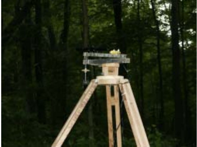
TJ OYERS LASER COMMUNICATOR