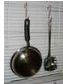
Make Great-Looking S-Hooks - Cheap by brbaldwin