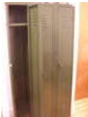
From old locker to hip wardrobe by jdrenard