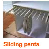
Sliding pants rack by phantazn