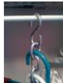
Space Saving Closet Hangers by chwbcc