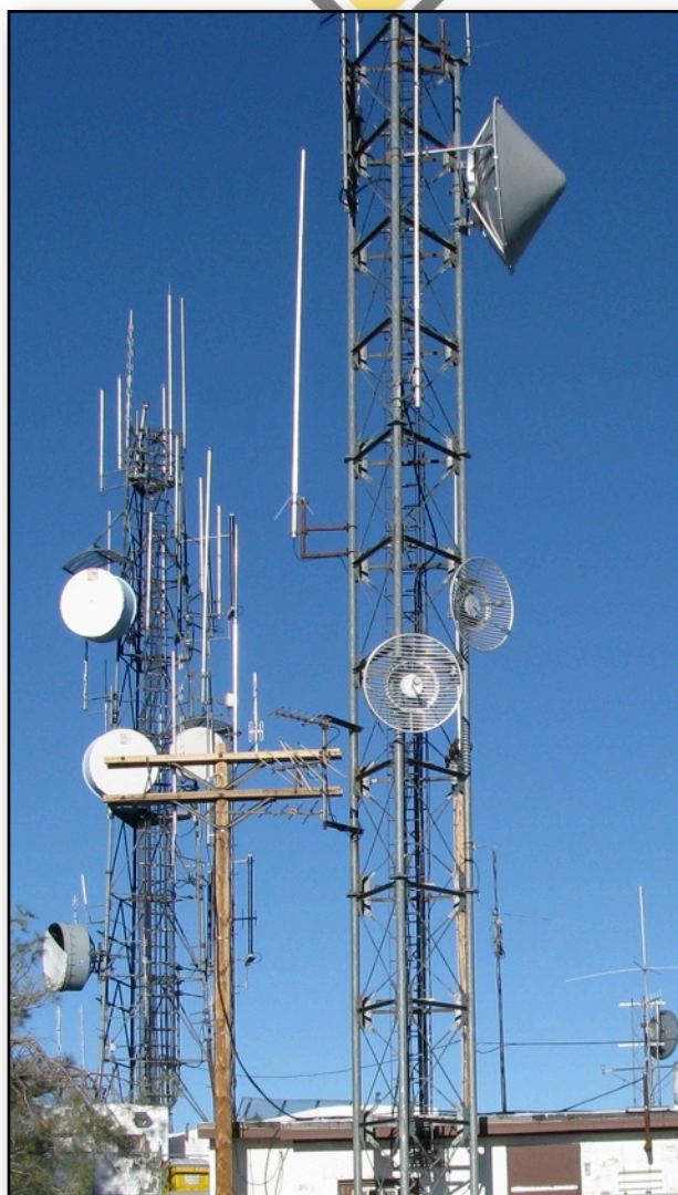
Mt. Disappointment repeater antennas