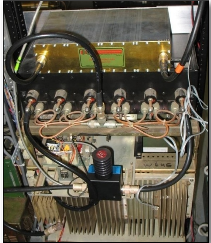
Clockwise from top, relay rack equipment and cabling behind a local UHF repeater, six resonant cavities of a VHF repeater, a mobile class radio, and three popular multi-band handheld radios.