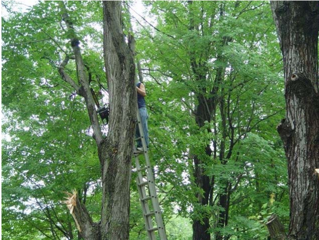
Who is that hiding in the Tree?