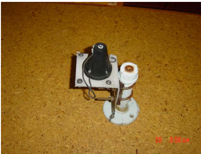
Despite our best plans, we did have a casualty, the packet antenna got damaged. N3SRD replaced the antenna with one of more gain.