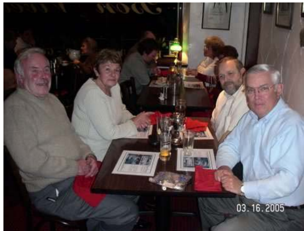
Enjoying an eyeball QSO (L to R) MJ1CYD, MJ1CYD's XYL, K3PLV and K8PT

We arrived on Jersey three hours late, which wasn't all that bad considering everything. We picked up our hired car (rental car) and drove to St. Aubin to check into the guesthouse where we stay. The keys to the Jersey Amateur Radio Society club station were waiting for us and we drove over to the station, which is in a World War II German Signal's bunker. I've always had trouble sleeping on flights, but this time had actually gotten about three