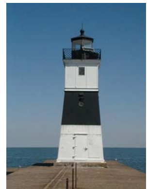
The North Pier Lighthouse

The Next RAE Club Meeting Will be on Thurs. August 2 at the Clubhouse on Wagner Rd.