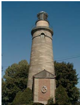
The Land Lighthouse