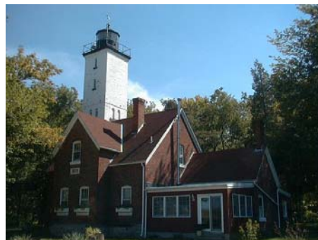
The Presque Isle Lighthouse