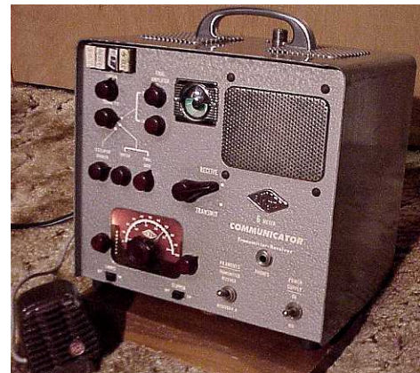
The Radio of the Day 1954 6m am Gonset Communicator List Price $229.95