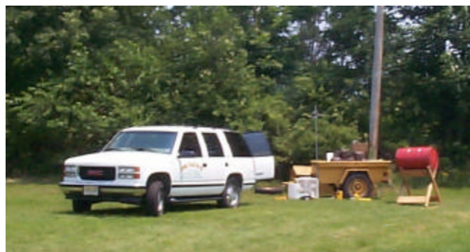
THE CRA II GENERATOR!