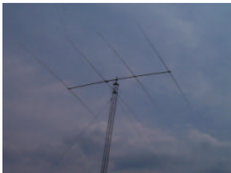
20 Meter Beam

Outstanding FUN!! Cherryville All The Way!!