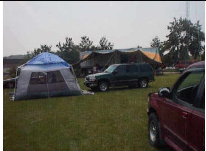
CRA FD: 20/40 CW Tent and Diner