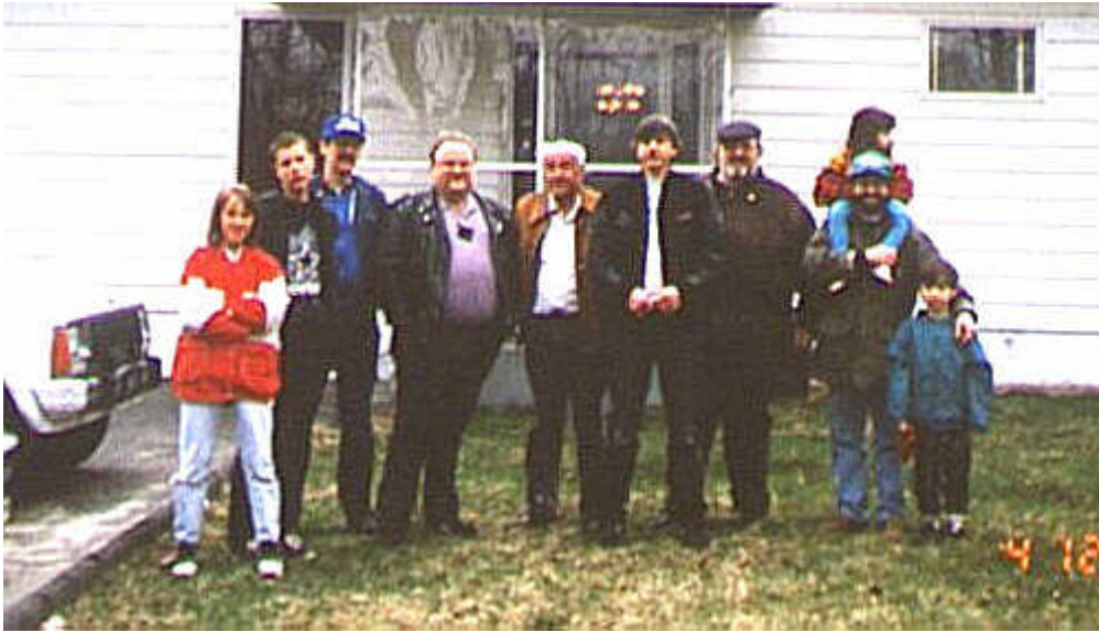
Waterbury Amateur Radio Club Visit to WATR 1320