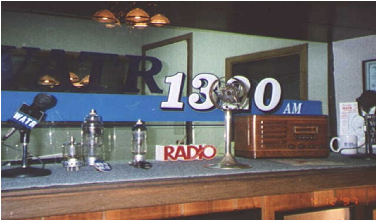
WATR 1320 "Oldies" Showcase