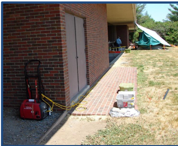
W1HP Honda-2000 Genertor