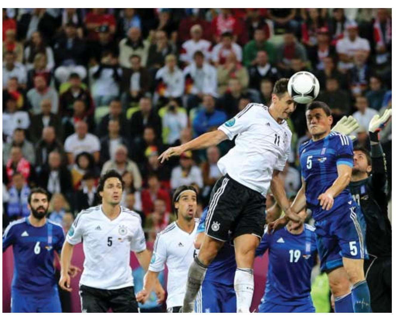
Miroslav Klose of Germany scores their third goal during the UEFA EURO 2012 quarter final match between Germany and Greece at The Municipal Stadium on June 22, 2012 in Gdansk, Poland.

Germany crushed Greece 4-2 in a one-sided Euro 2012 quarter-final on Friday and set up a last-four clash against England or Italy with their 15th successive win in competitive matches. The Germans, who will have to wait until Sunday to find out their semi-final opponents, have won all five European Championquarter-finals they have played and they have reached the final on the four previous occasions.