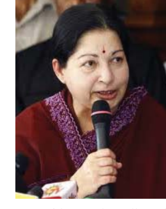
Besides, a skywalk and bridge connecting Central

An official release here said as part of traffic decongestion measures, a flyover would be constructed at Koyambedu at a cost of Rs