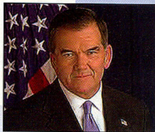
Homeland Security Secretary Tom Ridge: "We've laid out a public goal, and you've got to help me meet it!"

According to Secretary Ridge, "If you ask people in south Florida or the Outer Banks of North Carolina about preparedness, they already know about buying supplies, keeping extra batteries handy, and even having a hurricane evacuation route planned. They get it. They hope they're not