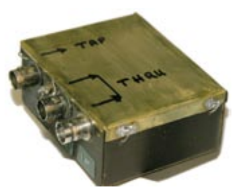
Figure 2 — Sample of a box made with PC board with a sheet brass cover overlapping all four sides. Note the BNC connectors and feed through insulator.

My modules are enclosed in boxes made from unetched copper clad material. For the covers I cut sheet brass half an inch wider and longer than the size of the PC box. I then