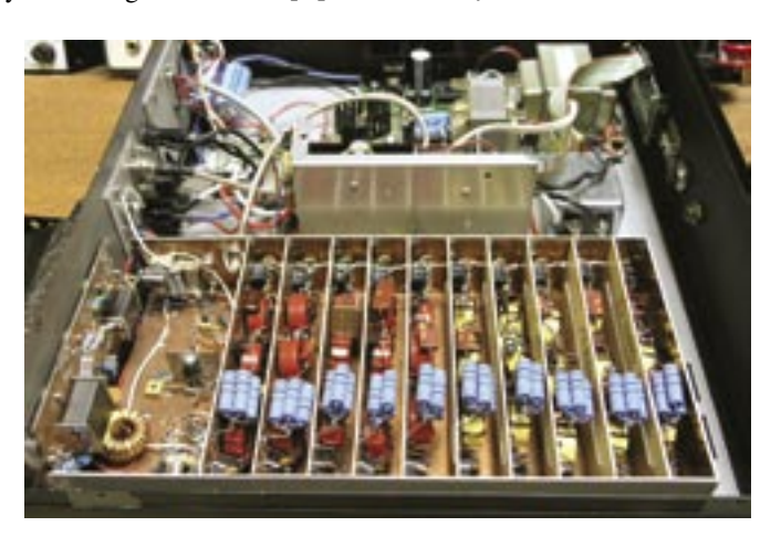
Figure 7 — The 100 W amplifier, 10 low pass filters and the power supplies are located in separate subenclosures.