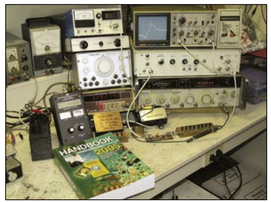
Figure 5 — The VE7CA work shop shows some of the home built and surplus test equipment used in the construction of the HBR-2000.

circuit for a particular module, I build the new circuit and mount it in a new box, disconnect the old design and insert the new one in its place. In fact I have already done this very thing on several occasions. I tried three different front end receiver mixer designs before settling on the final mixer design. Since I had more than one mixer circuit, all in separate boxes, I was able to make accurate, comparative measurements by substituting one box for another, thus allowing me to make an educated decision as to the mixer design I was going to keep.