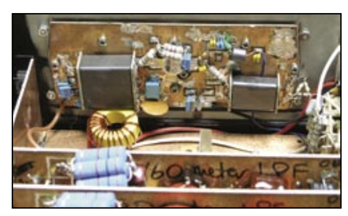
Figure 6 — The 100 W amplifier board.

Be resourceful when collecting test equipment. Check your local ham club. You