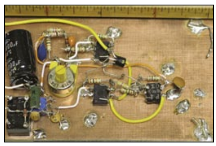
Figure 3 — Sample of "ugly construction" method.

Each module is designed for an input and output impedance of 50\,\Omega except for the audio output that, in my case, is 8\,\Omega for speaker connection. Thus I am able to employ 50\,\Omega coax cable with BNC connectors to connect the RF paths between the different modules. An added benefit of this construction method is that if I decide in the future to try a different