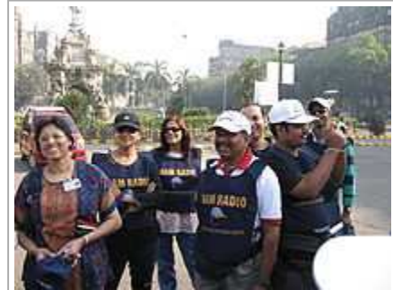
Amateur radio operators at a foxhunt in Mumbai

Licensed holders 16,000 Call sign blocks VUA to VWZ ATA to AWZ 8TA to 8YZ