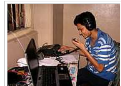
An operator monitoring the air

To obtain a licence in the first four categories, candidates must pass the Amateur Station Operator's Certificate examination. [17] This examination is held monthly in Delhi, Mumbai, Kolkata and Chennai), every two months in Ahmedabad, Nagpur and Hyderabad, and every four months in some smaller cities. [18] The examination consists of two 50-mark written sections: Radio theory and practice, Regulations; and a practical test consisting of a demonstration of Morse code proficiency in both sending and receiving. [19] After passing the examination, the candidate must then clear a police interview. After clearance, the WPC grants the licence along with the user-chosen call sign. [20] This procedure can take up to 12 months. [20]