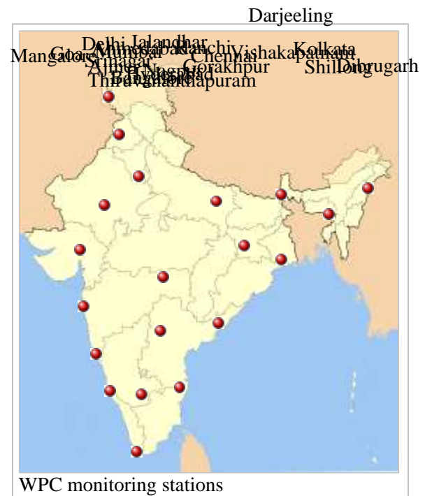
WPC monitoring stations

1978, the Indian Wireless Telegraph Rules, and the Indian Telegraph Act, 1885. The WPC is also responsible for coordinating with the Ministry of Internal Affairs and the Intelligence Bureau in running background checks before issuing amateur radio licences. [35]