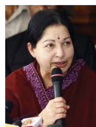
Besides, a skywalk and bridge connecting Central

An official release here said as part of traffic decongestion measures, a flyover would be constructed at Koyambedu at a cost of Rs 40 crore.