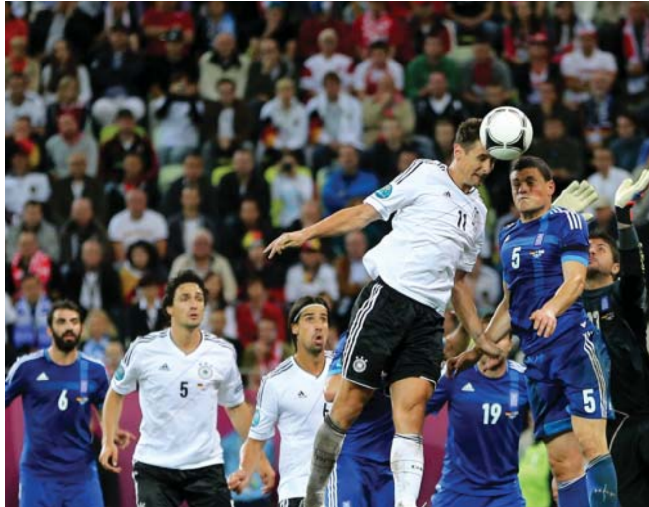
Miroslav Klose of Germany scores their third goal during the UEFA EURO 2012 quarter final match between Germany and Greece at The Municipal Stadium on June 22, 2012 in Gdansk, Poland.

Germany crushed Greece 4-2 in a one-sided Euro 2012 quarter-final on Friday and set up a last-four clash against England or Italy with their 15th successive win in competitive matches. The Germans, who will have to wait until Sunday to find out their semi-final opponents, have won all five European Championship quarter-finals they have played and they have reached the final on the four previous occasions.