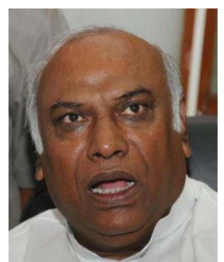
after getting approval in the Cabinet.

Mr Kharge said that a Bill to fix minimum wages for Beedi workers, domestic servants and safai workers has been prepared and it would be introduced in the next Session of Parliament