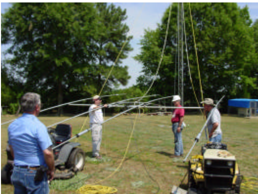
Ground crew preparing to pull up new antenna on a rope side.