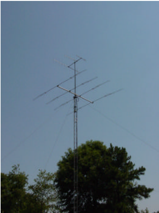
Tower looks much taller now. KLM HF tri-bander and on top 2 meter, 220MHz, and 440MHz beams.