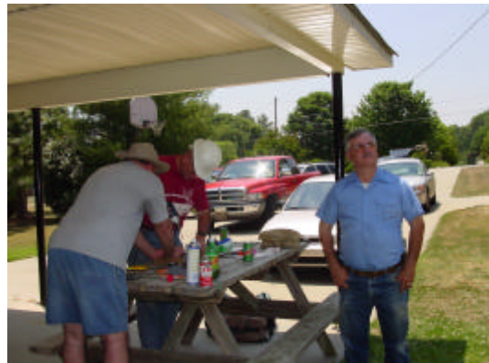
Same crew at work.