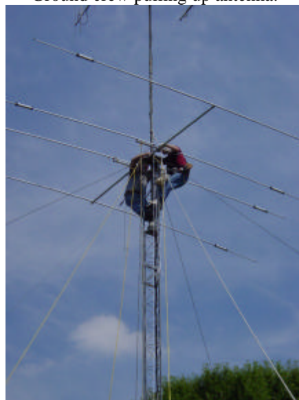
Tower crew doing the final touches.