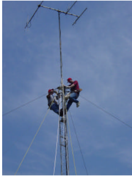
Tower crew ready for antenna.