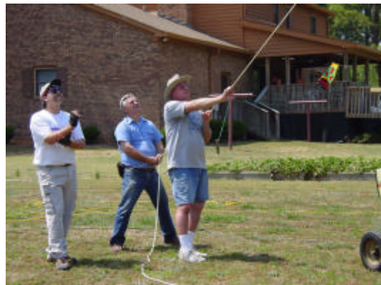
Ground crew pulling up antenna.