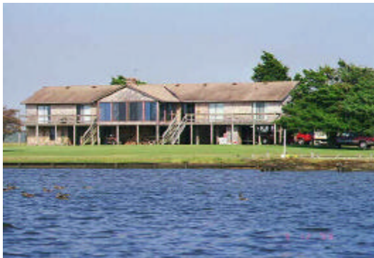
Piney Island Gun Club