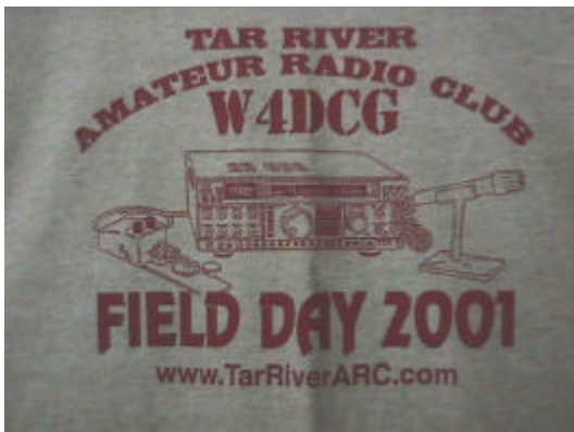
FD 2001 T-SHIRT