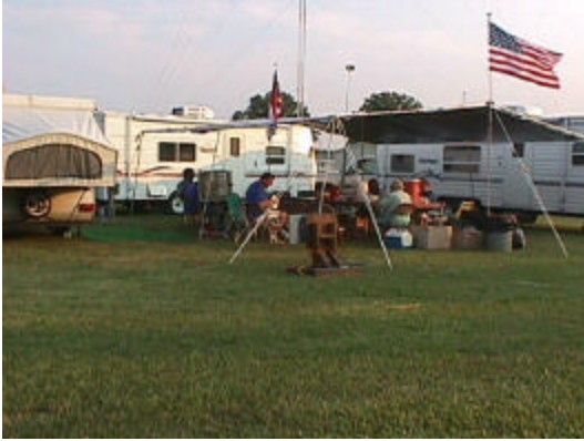
Field Day 2000

Field Day: June 23 rd and 24 th Location: Bridgersville Campground, Bridgersville, NC ( HWY 42 East of Wilson) Setup: Friday, June 22 nd 6PM Setup: Saturday, June 23 rd at 9AM Start: Saturday, 2 PM Take-down: Sun, June 24 th at 2 PM