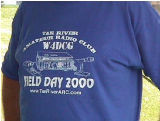
2000 FD T-Shirt

Anyone interested in 2001 Field Day Tee Shirts this year? The ARRL Field Day 2001 is fast approaching, the dead line for the FD 2001 Tee Shirts is this meeting. We will need the orders