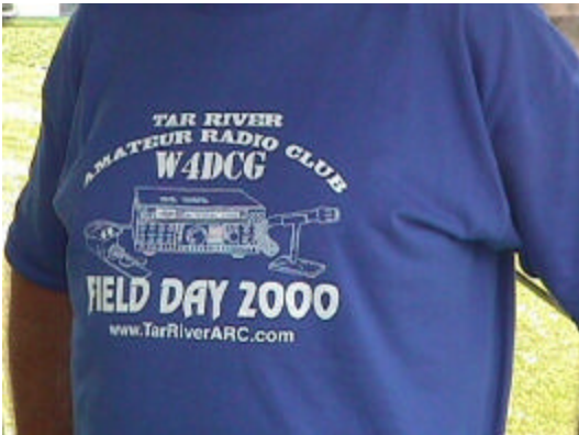
2000 FD T-Shirt

Anyone interested in 2001 Field Day Tee Shirts this year? The ARRL Field Day 2001 is fast approaching, the dead line for the FD 2001 Tee Shirts is this meeting. We will need the orders