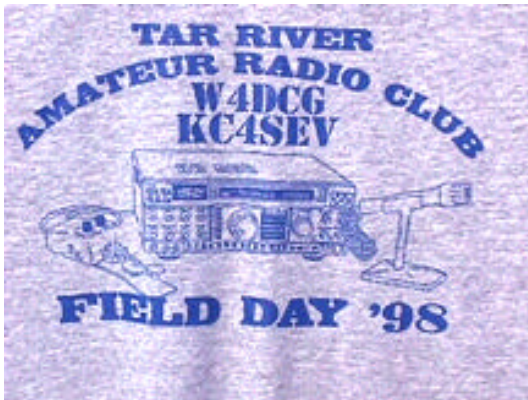
1998 FD T-Shirt

Anyone interested in 2000 Field Day Tee Shirts this year. The ARRL Field Day 2001 is fast approaching, we need to make many decisions this meeting dealing with Field Day. Only the May and June meetings are left before the big date. Come to the meeting and let's have a successful Field Day for 2001