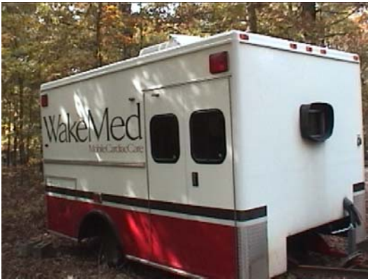
Anyone have a spare chassis or trailer?