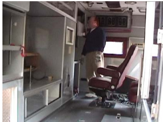
Plenty of room for radio rear