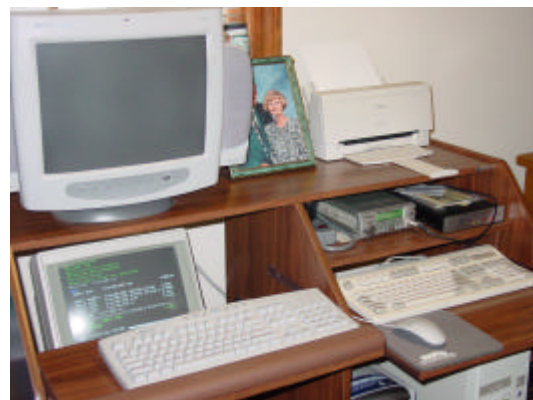
Packet Station and home computer