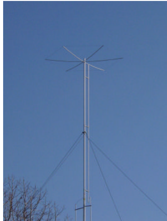
Gap DX Challenger

He is active on 160, 80, 40, 20, 15, 10 and the WARC bands. On the opposite end of coax from the TL 922A is a KLM KT34A tri bander 4 element beam at about 60 foot. Also used is a Gap DX Challenger vertical that covers 160, 80, 40 and 20 meters.