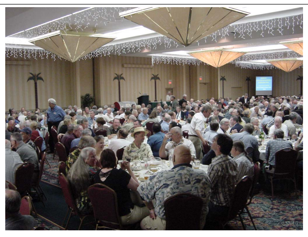
2005 Visalia DX Convention Banquet