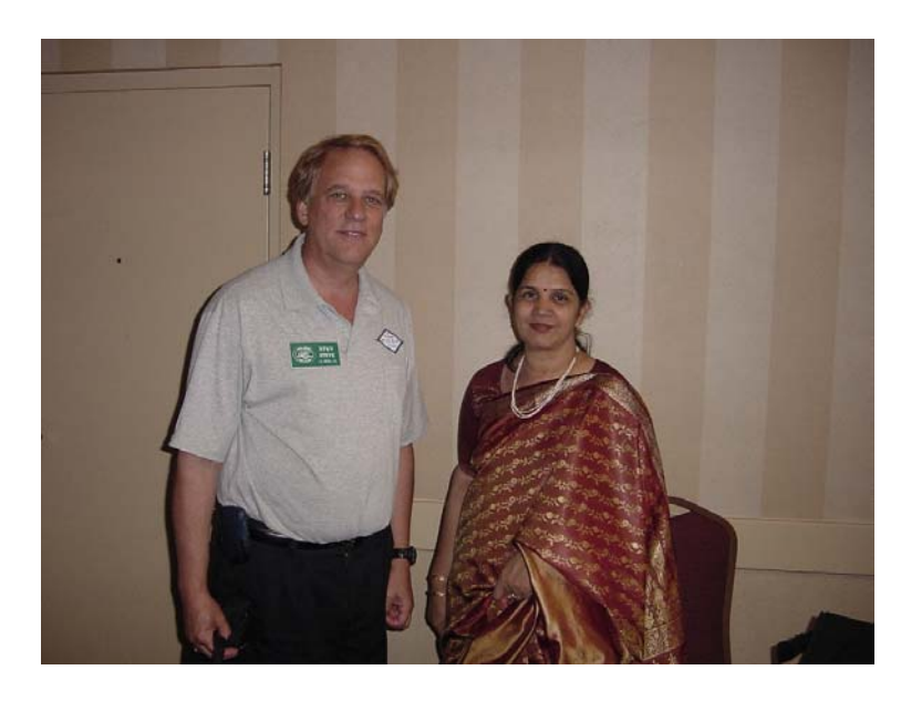
NF6V with VU4RBI