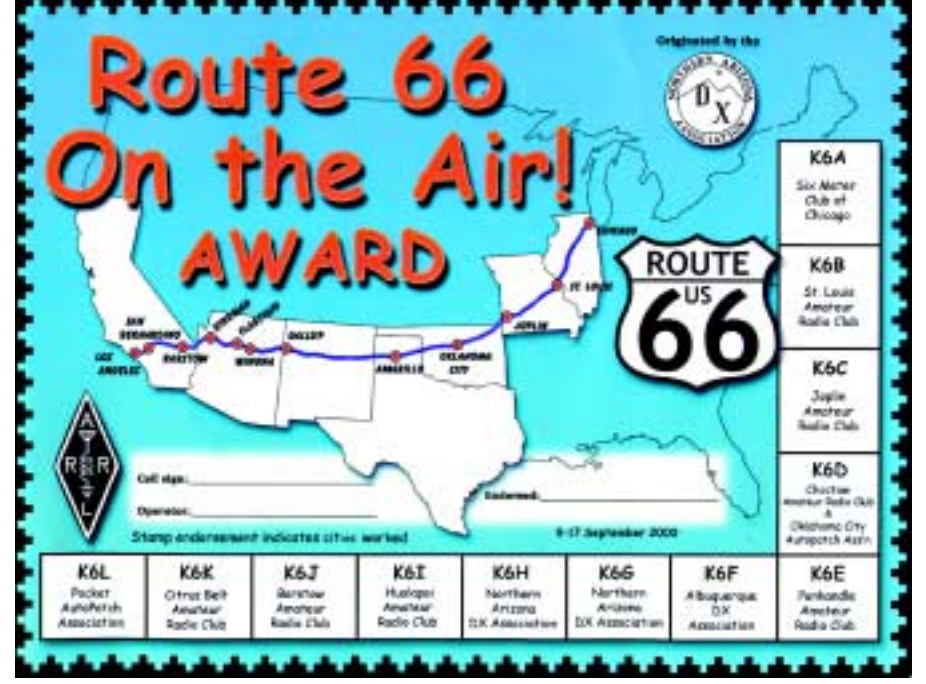
Here is the Route 66 on the Air! certificate for the 2000 event. A minimum of one QSO with any of the special-event stations was required for the basic award. A red endorsement stamp (the outline of a US highway sign) is used to indicate the stations worked.

As the nation's transportation infrastructure modernized, however, stretches of this historic road were bypassed by interstate highways. The process started in 1953 (Oklahoma City to Tulsa) and ended in 1984 (Williams, Arizona). US Route 66 was officially decommissioned in 1986. Pieces of the road are still in use today, renamed "Historic Route 66." I'm fortunate enough to live near Flagstaff,