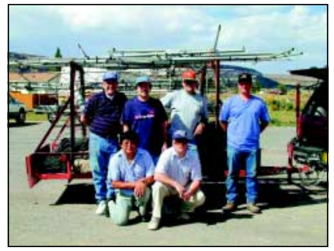
Here is the K6F "take-down" crew (shown top, I-r, are KE5BL, K5TA, KB5YAY and KC5WDV; shown bottom, I-r, are KB5VQC and KM5GH).