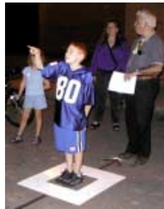
Is THAT the ISS?

The 24th is also the date for our project meeting for November. That meeting will start at 7:30 that evening. The Project will be the design and construction of circularly polarized Yagis for ARISS.