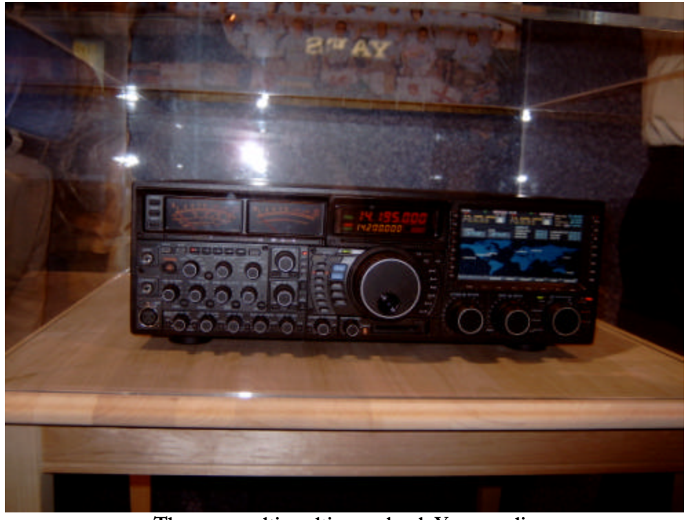
The new multi-multi-megabuck Yaesu radio "Jeepers! Lookit all da buttons!"