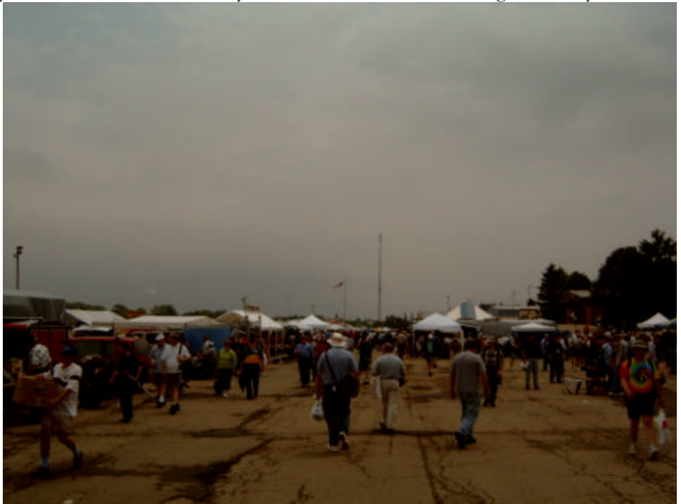
The clammy Dayton 2004 weather