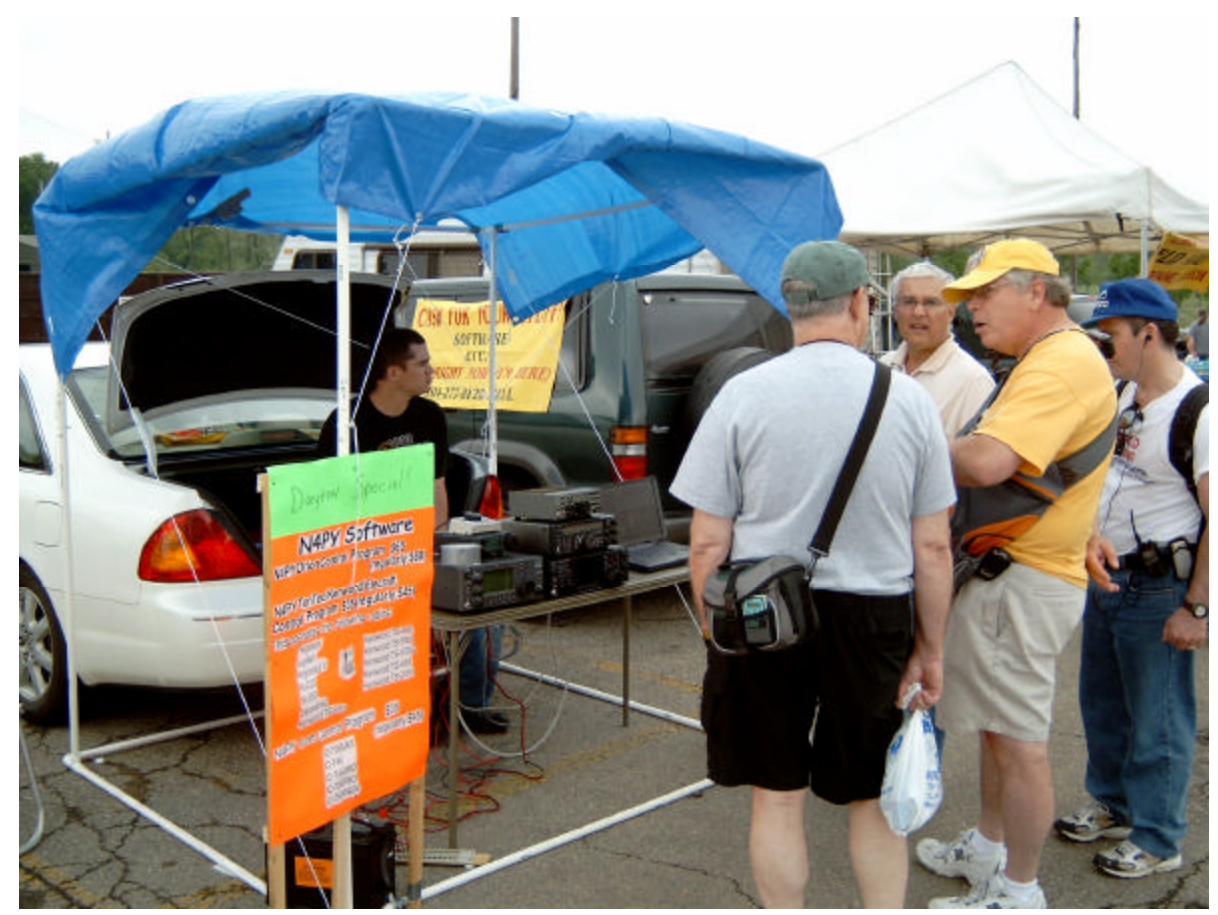
And even a couple of familiar faces in the Hamvention flea market crowd

To see lots more photos of the 2004 Hamvention, try: