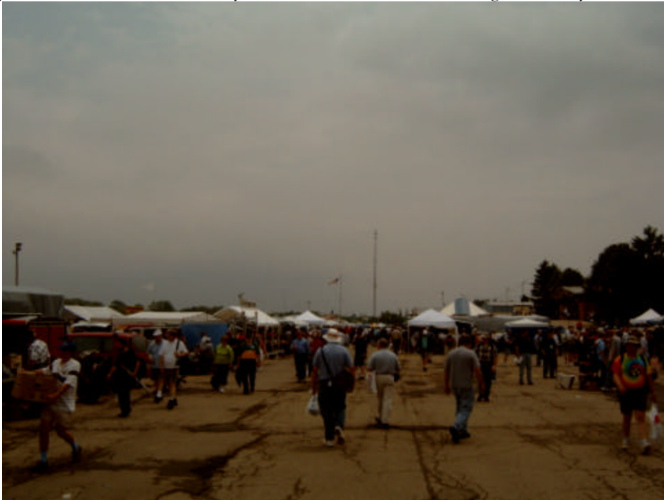
The clammy Dayton 2004 weather