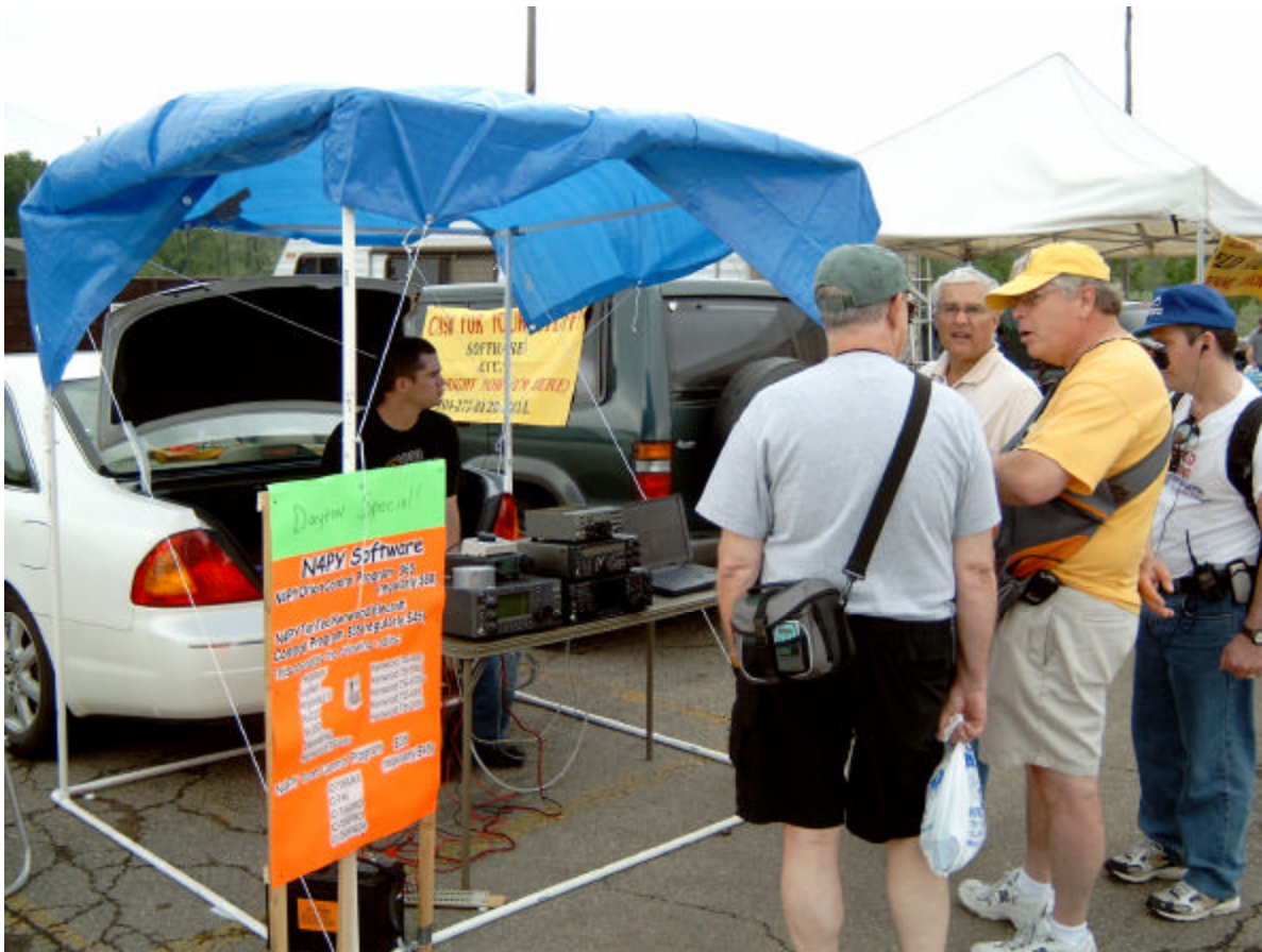
And even a couple of familiar faces in the Hamvention flea market crowd

To see lots more photos of the 2004 Hamvention, try: