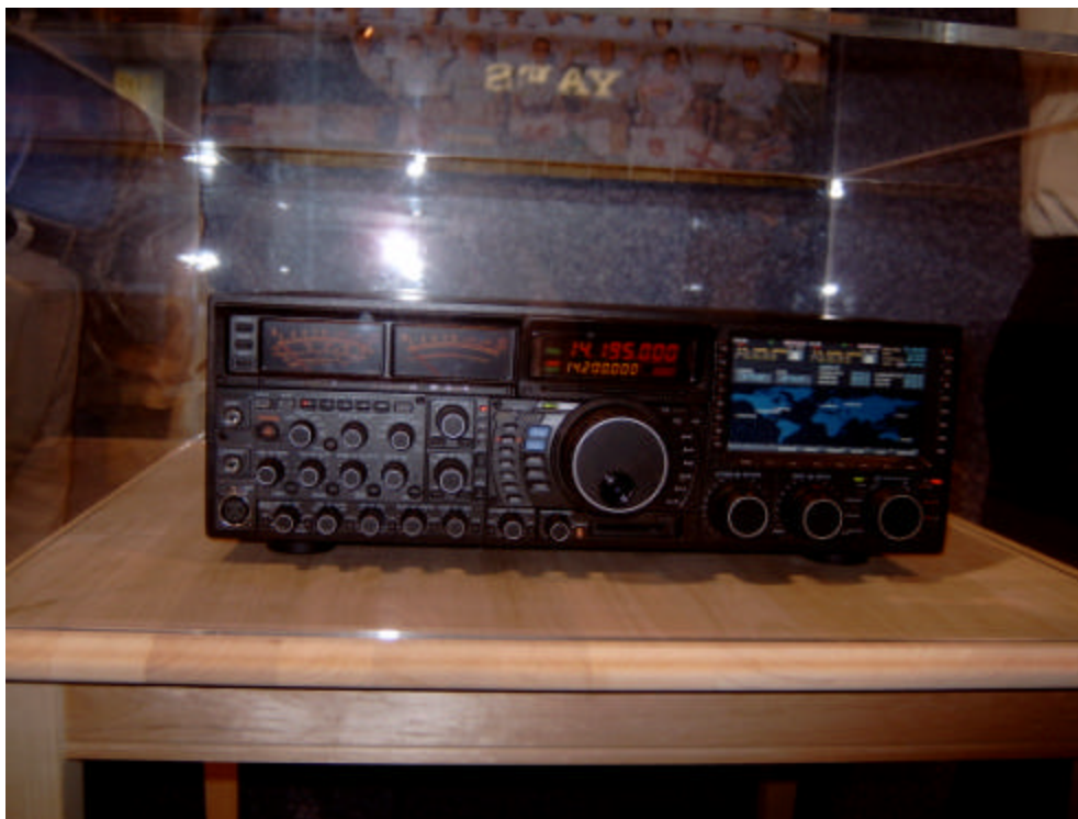
The new multi-multi-megabuck Yaesu radio "Jeepers! Lookit all da buttons!"