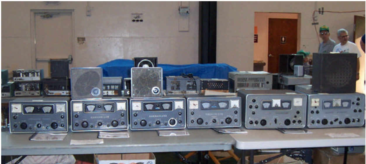
The payoff, a fully stocked hamfest!