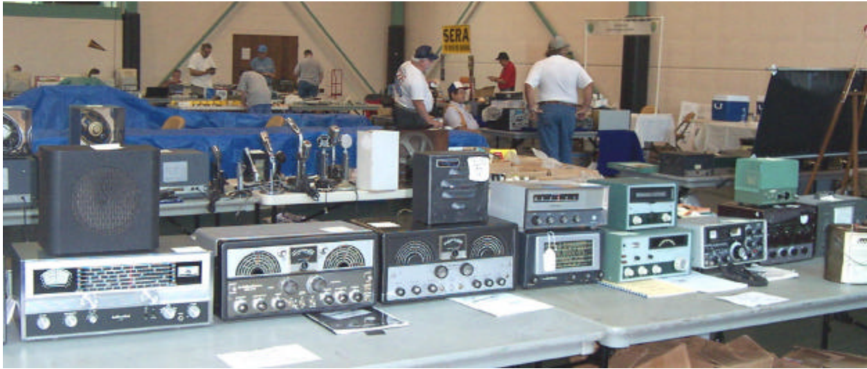
and a fine selection of boat anchors, too!