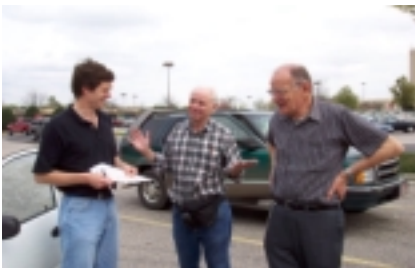
Figure 1- What, no hints?