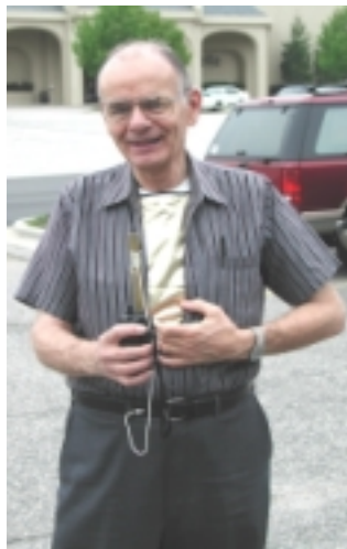
Figure 2- Body Armor!