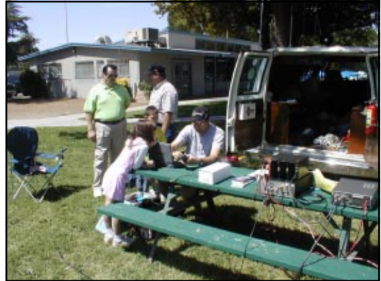
...Then the setup began...