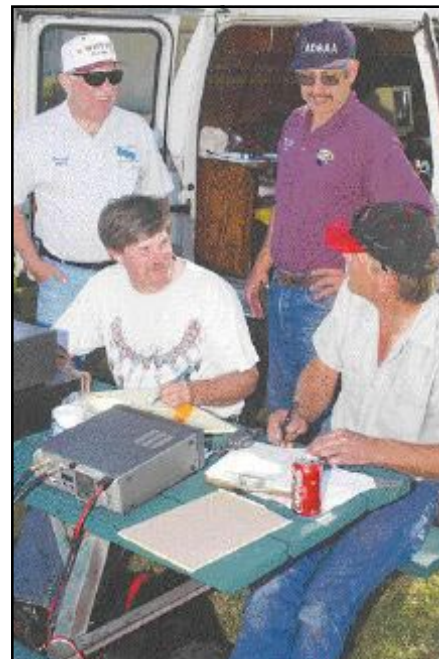
...While these four guys made front page of the news. =>