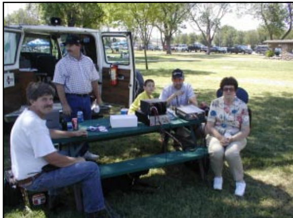
...And others bemuse...