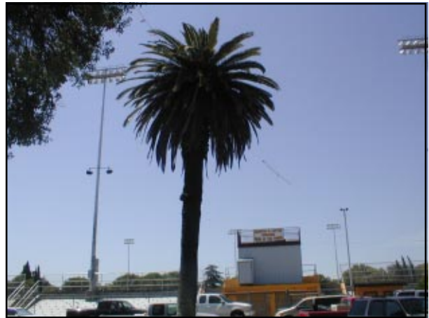
...All according to plan.