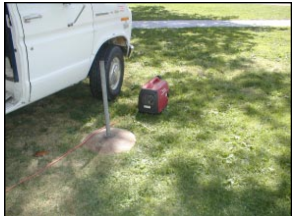
...And this Generator powered our station.