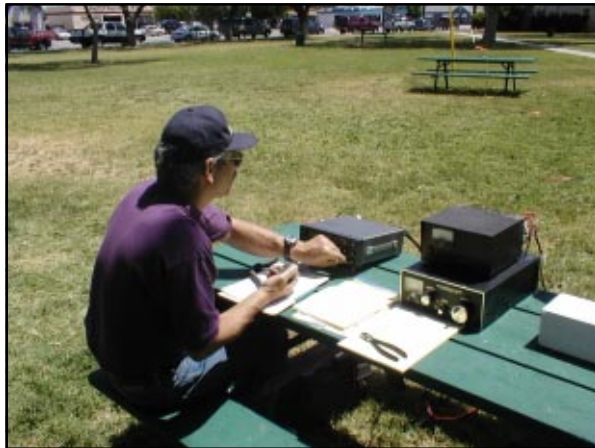
...We turned on the rig and worked the whole nation.