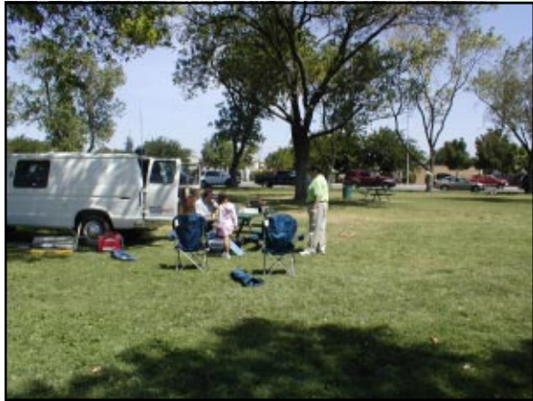
Our hard work paid off...