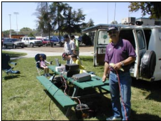
Our rigs were set up...