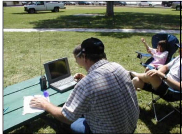
...And after some aggravation...