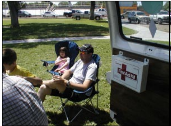
Some were seen to relax...