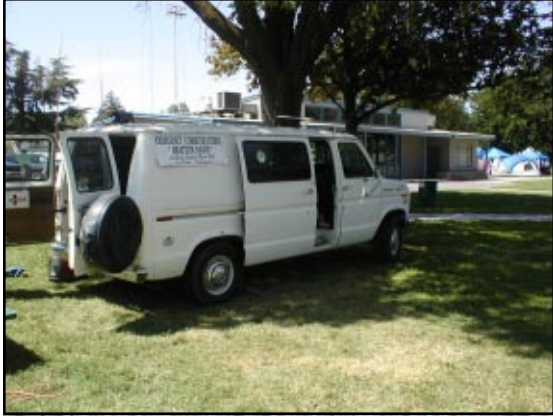
It was only a van...