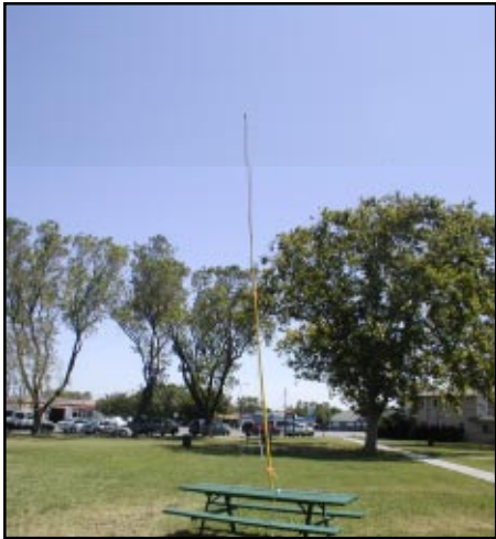
...And Antennas went up...