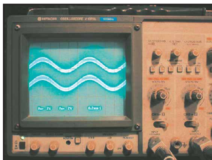
Figure 3 —An oscillating circuit—with a 1 kHz sine wave input, both the input (top) and output (bottom) signals show significant oscillation at more than 1 MHz. Experiment with lead placement and circuit component placement to learn what causes and prevents oscillation.