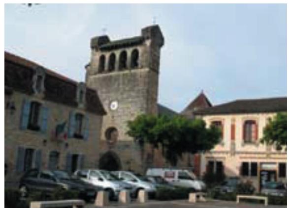
Our town square in Castelfranc