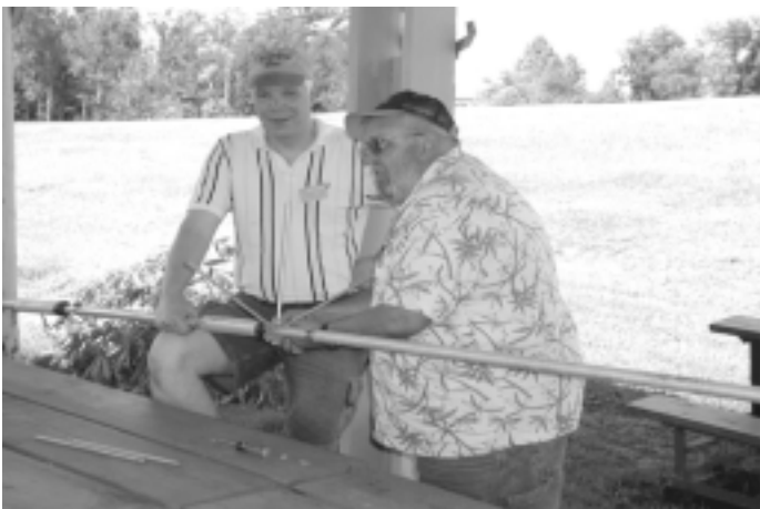
Don (WA5DM) and Don (W5DJW) assemble a vertical antenna for Field Day operations.