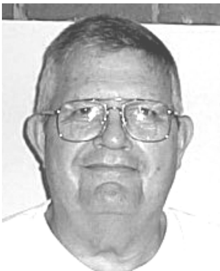
August Maggiore, Sr. (General) October 4, 2003