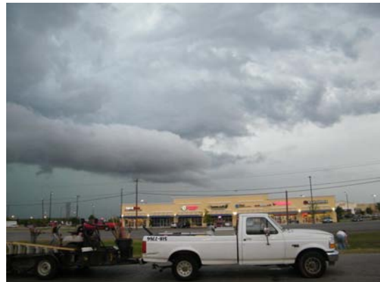
Another view of the roll cloud

Even experienced spotters like to have riders as two sets of eyes work better than one set. Sometimes one will see something the other can't or doesn't see. It is even better to have a rider when the other is driving so that the driver can keep his eyes on the road and the rider can be watching the storm. If you want to ride with someone, You can give me a call at 325-725-2642 (home) or 325-267-0838 (cell) and I can see if we can find you a partner,