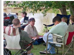
May 2009 Social