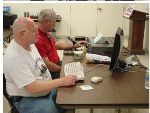
Field Day 2008

Here it is June and decisions have been made. Our Field Day Site is listed at the ARRL website and will be held at the Hamby Volunteer Fire Department Highway 351 about 7 miles north of the Wal-Mart on Highway 351. We are planning on a barbecue with meats being purchased (donations will be helpful to recover the cost of the meats), along with your bringing maybe a side dish or a dessert to share. We will be running 3F using the call sign of K5ABI for the main call and KF5BAD for the GOTA station