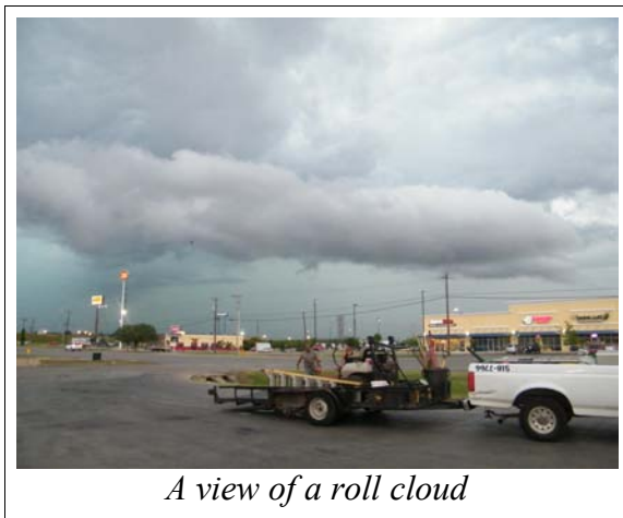
A view of a roll cloud

approaching 70 mph. As usual, there still seems to be that strange split around Abilene where the