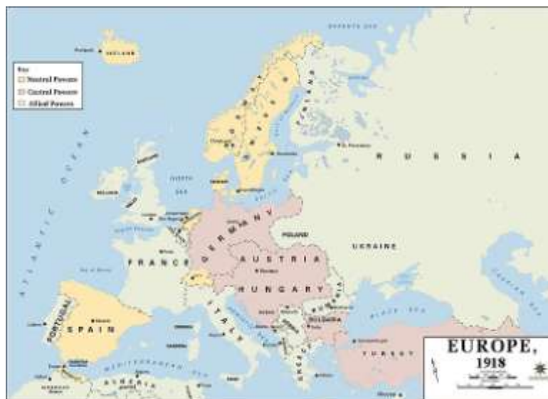
Europe in 1918