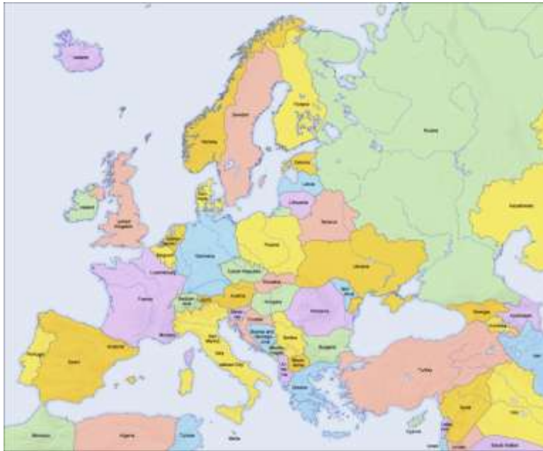
Europe in 2009