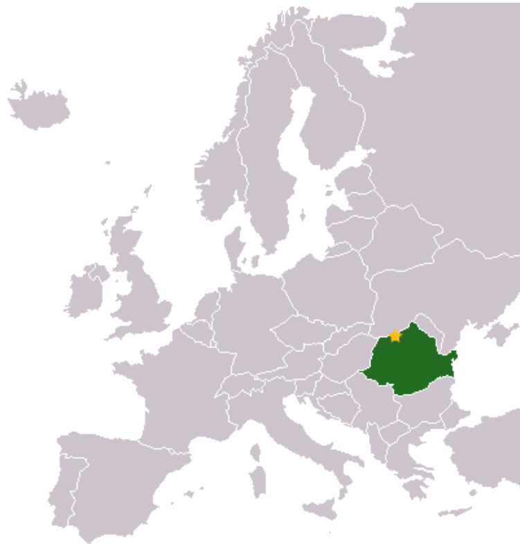
Location of Sighet in Romania