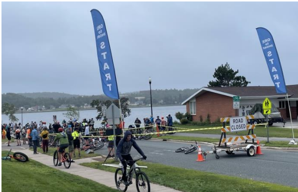
On August 12 th , HARA Hams provided communications for the Ore to Shore Mountain Bike Epic. Over 2,500 riders participated in the various rides!

The below pictures are just a sampling of what our club members have been up to recently. If you have photos to share, please send them to me at n8nav1@charter.net .