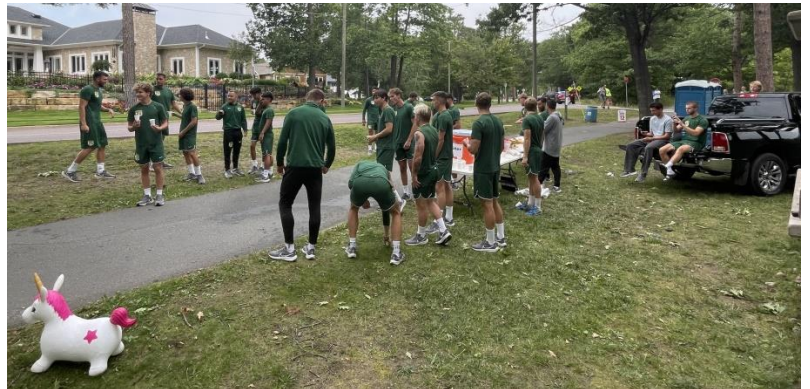
On September 2 nd I had the privilege of working an aid station for the Marquette Marathon and enjoying the company of the NMU Men's Soccer team during the morning.