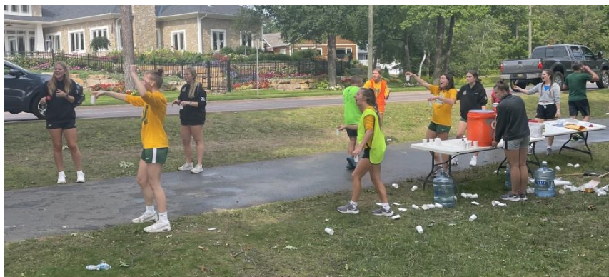
In the afternoon, an enthusiastic group from the NMU Women's Lacrosse team took over!