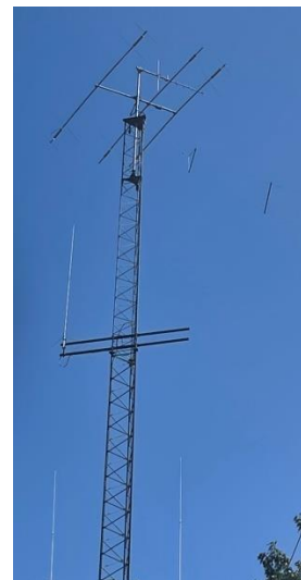
Speaking of towers, the one at the National Weather Service office. Note the beam and wire dipole.