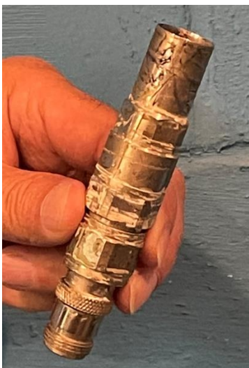
The culprit – a bad connector in the feedline will need to be replaced.