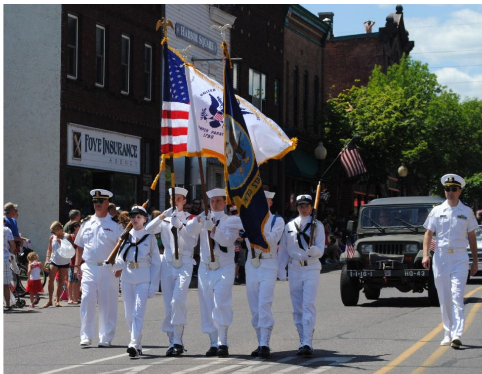
Marquette's 4 th of July Parade 2014

End of Meeting –The meeting was concluded at 7:15pm and the picnic was resumed.