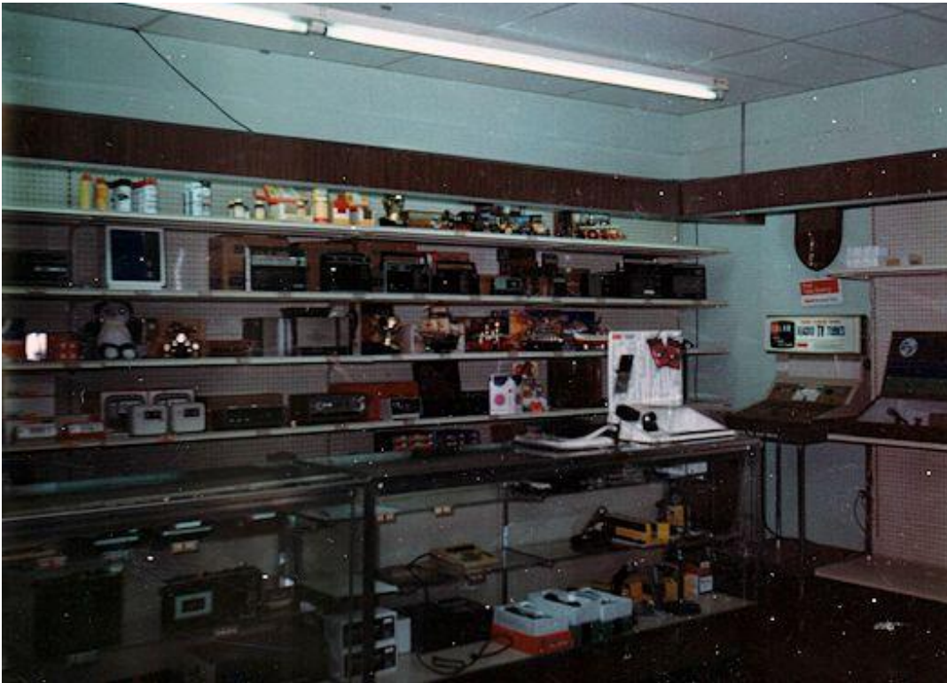
Northwest Radio Photo