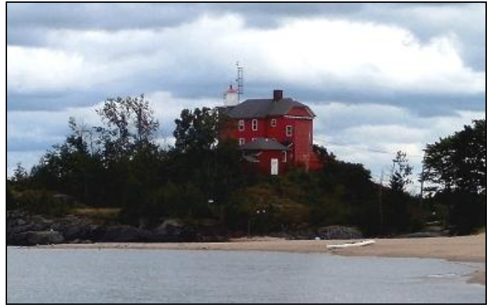
What a great location to operate from.