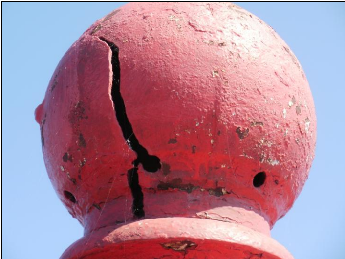
What am I? Where am I?