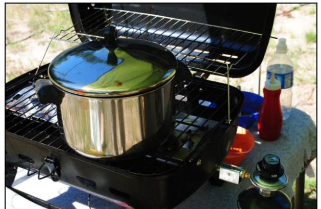
And what is in the pot? Well what's in it is what makes the trip well worth it.