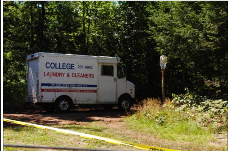
I never expected this to pass us by at the Beaver Pond location as we were working the Ore To Shore Bike Epic.