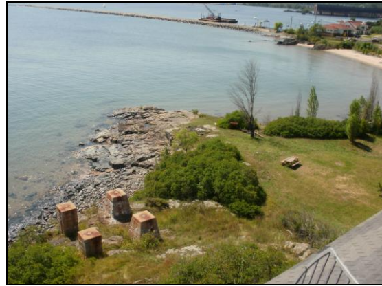
View looking SW from our operating position.