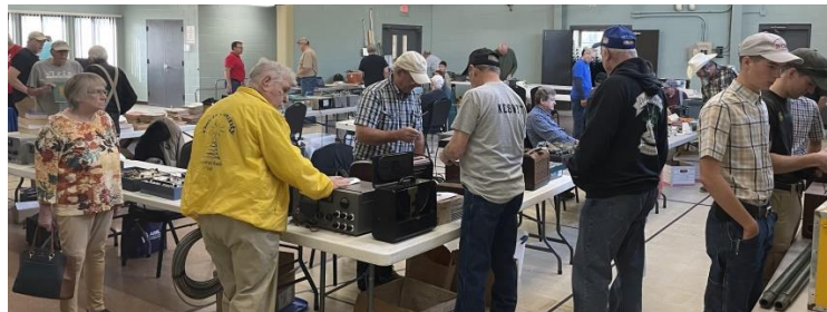
At the end of the day, a good time was had by all!