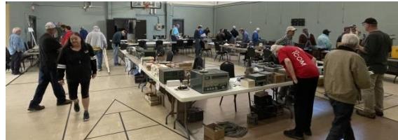
The crowd was small, but enthusiastic.