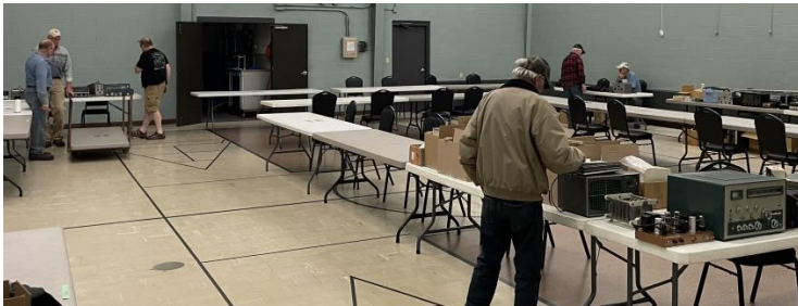
Friday night set-up went well.

The annual HARA Swap & Shop was held on Saturday, September 16, 2023.