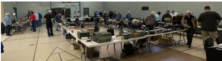
The early bird got the best deals!