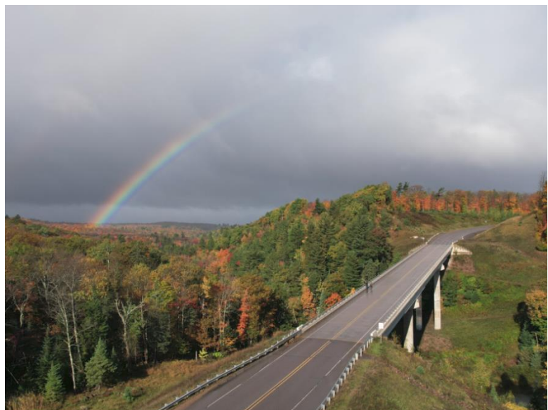
Impressive view of the "simulated" wildfire site from Dave's drone!