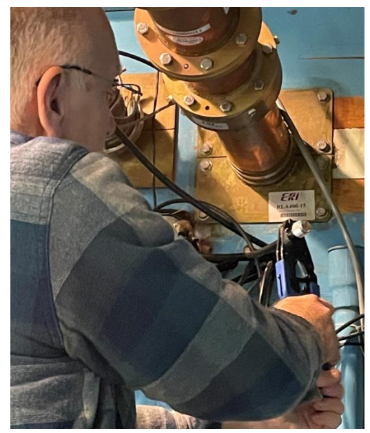
And crimping the new connector into place.