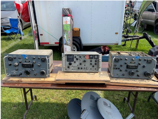
The Hamvention flea market had its share of old (and weighty) radios.