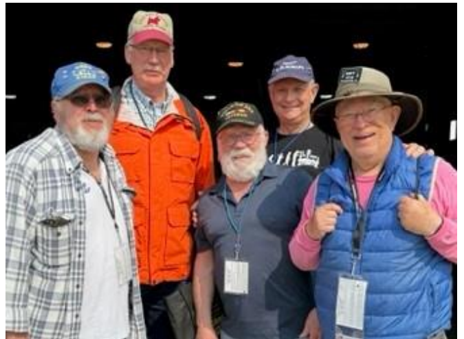
Most importantly, a GOOD TIME was had by all!

If you have never had the chance to attend the Hamvention “experience, I highly recommend it! It’s a bit of a drive from here, but you can usually find a ride. Hamvention 2024 is May 17, 18 & 19. I hope to see you there. 73!