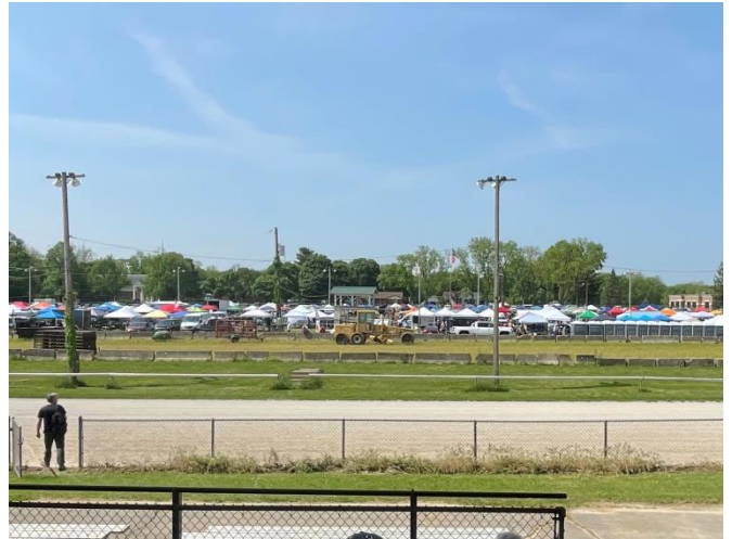
A shot of just a portion of the flea market taken from the grand stand.