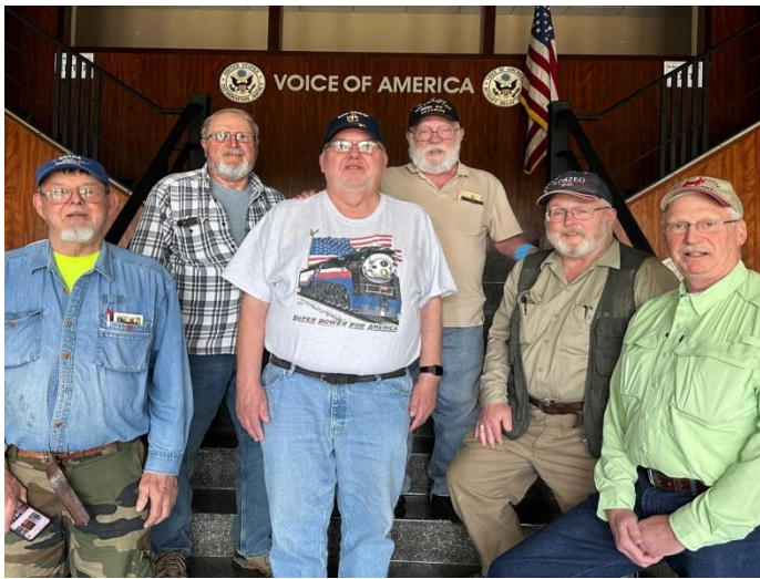
Some chose to visit the impressive Voice of America museum.