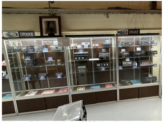
And an equally impressive display of RL Drake radio equipment!