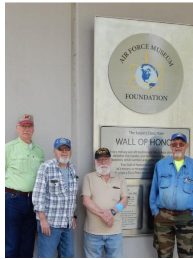
Others, the equally impressive Air Force museum.