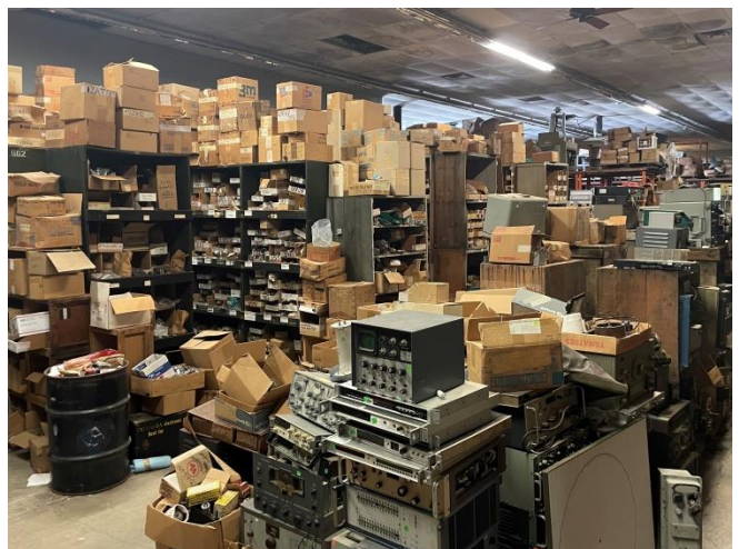
And their unique, if messy, array of "stuff"!