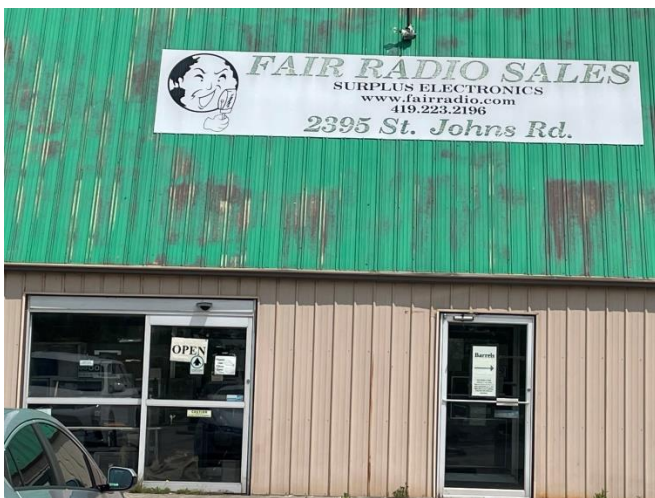
And what trip to Hamvention would be complete without a visit to Fair Radio Sales in Lima, OH.