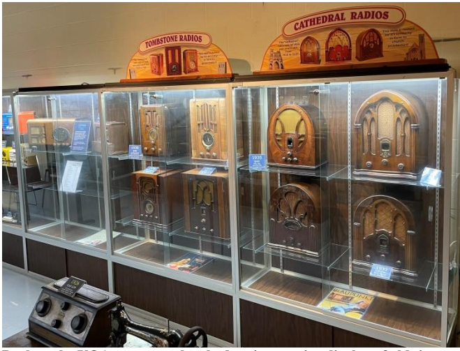
Back at the VOA museum, they had an impressive display of old time radios.