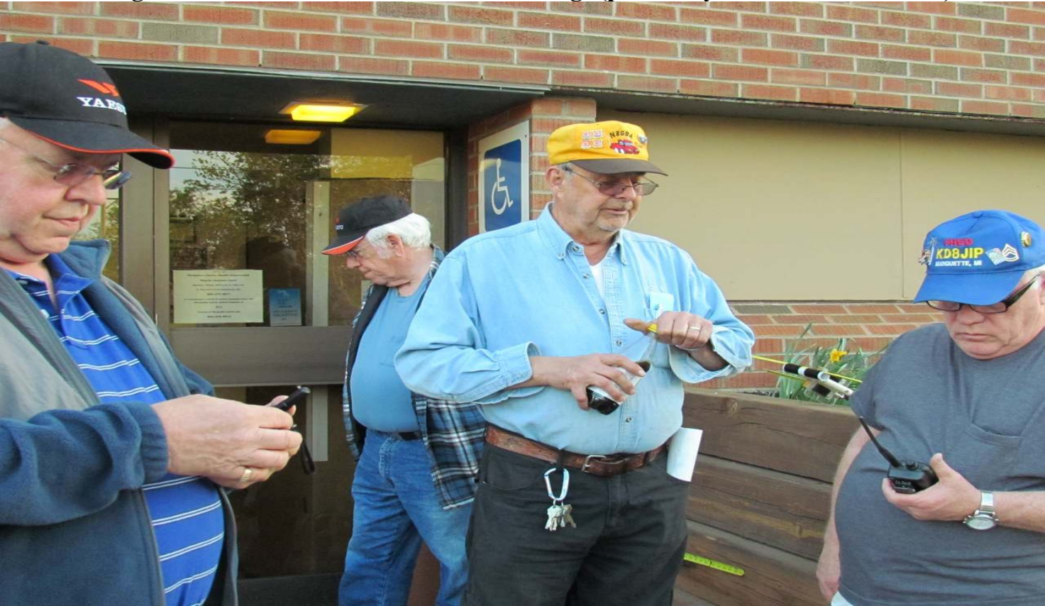
Fox Hunting Demonstration after the June Meeting