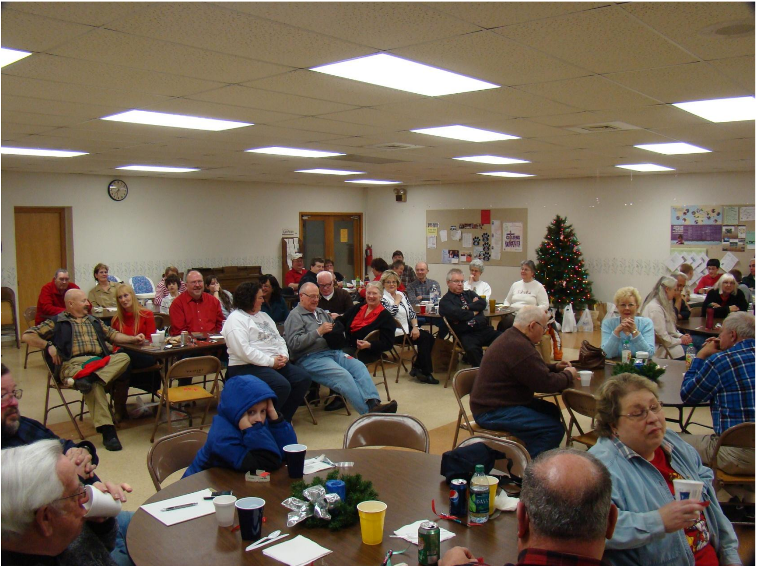
Some of the folks that attended the 2011 Christmas Dinner

http://www.facebook.com/#!/media/set/?set=a.294122707292069.60518.233495793354761&type=3