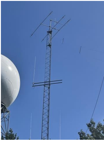
Antennas at the NWS office.