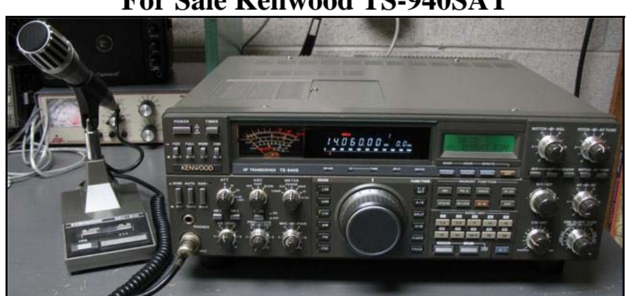
For Sale Kenwood TS-940SAT

Respectfully Submitted Jim W8QQE Secretary