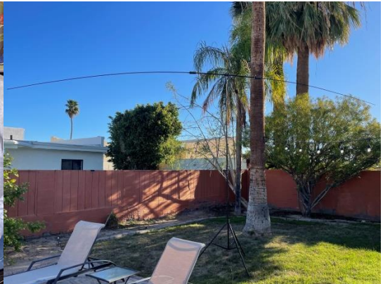
My Buddipole antenna in our backyard.