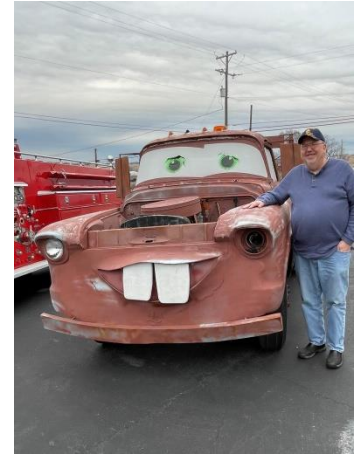
Hanging out with my friend Tow-Mater.