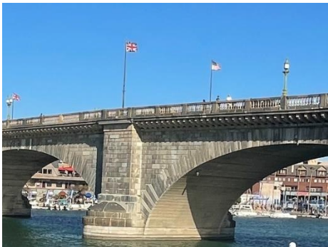
If you wonder what happened to the London Bridge, they moved it to Arizona!