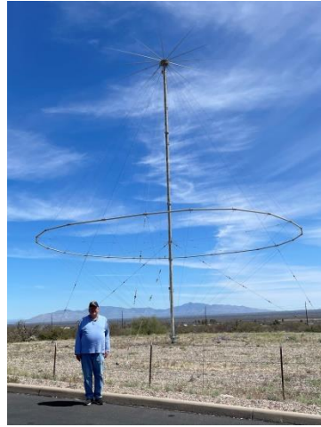
A dischage antenna outside of the Titan Museum.