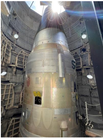
Part of a Titan II ICBM in the silo at the museum outside of Tucson, AZ.