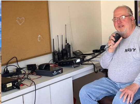
I did actually have a shack at our house in Yuma.