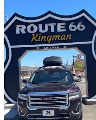
The last Route 66 stop in Arizona.