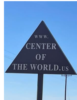
The Center of the World is in southern California, or so they think.