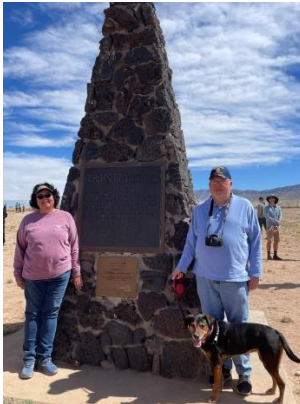
An obelisk marking the site of the first atomic bomb test near White Sands, NM.