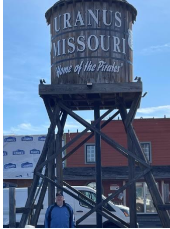
Eat your hearts out Mars mission!