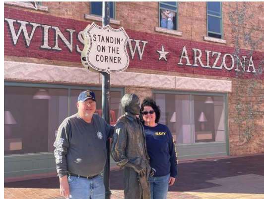
For fans of the Eagles hit, Take It Easy the famous corner in Winslow, Arizona.