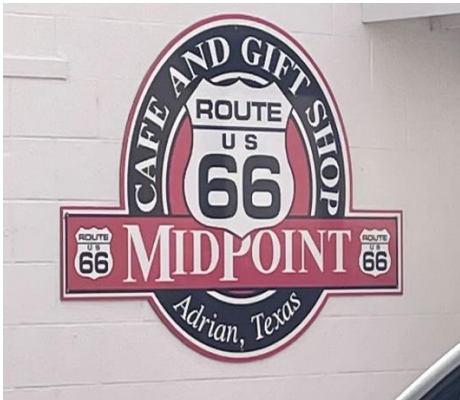
The Midpoint Café really is halfway and has great pie!