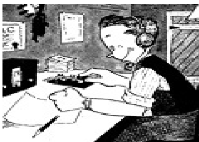
K8DD Multi Op station on 160 CW

The next major contest is the third weekend this month—the ARRL International DX CW Contest. DX stations work only US and Canada. The exchange is a signal report and state for US and VE and DX gives a signal report and their power output.