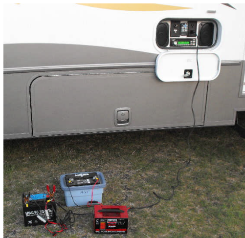
Charging batteries from Stu's motor home before the event.