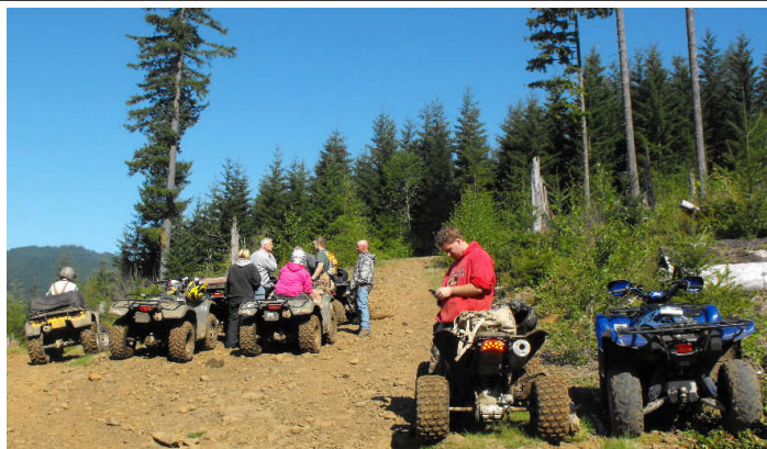
Several riders at one of the Fun Run checkpoints.

This year's Washington ATV Associations Fun Run at the Capitol State Forest found some 140 riders of motor cycles, quad runners, and one lonely tricycle eager to go run the trails. The 26 mile course was dry for the first time in years. The trail was in pretty good shape thanks to the ATV Club and its many work parties. The run started at 9 AM and all riders were on the trail by 9:15. The BEARS manned 4 check points and one spotter position. We could have used an additional person but we