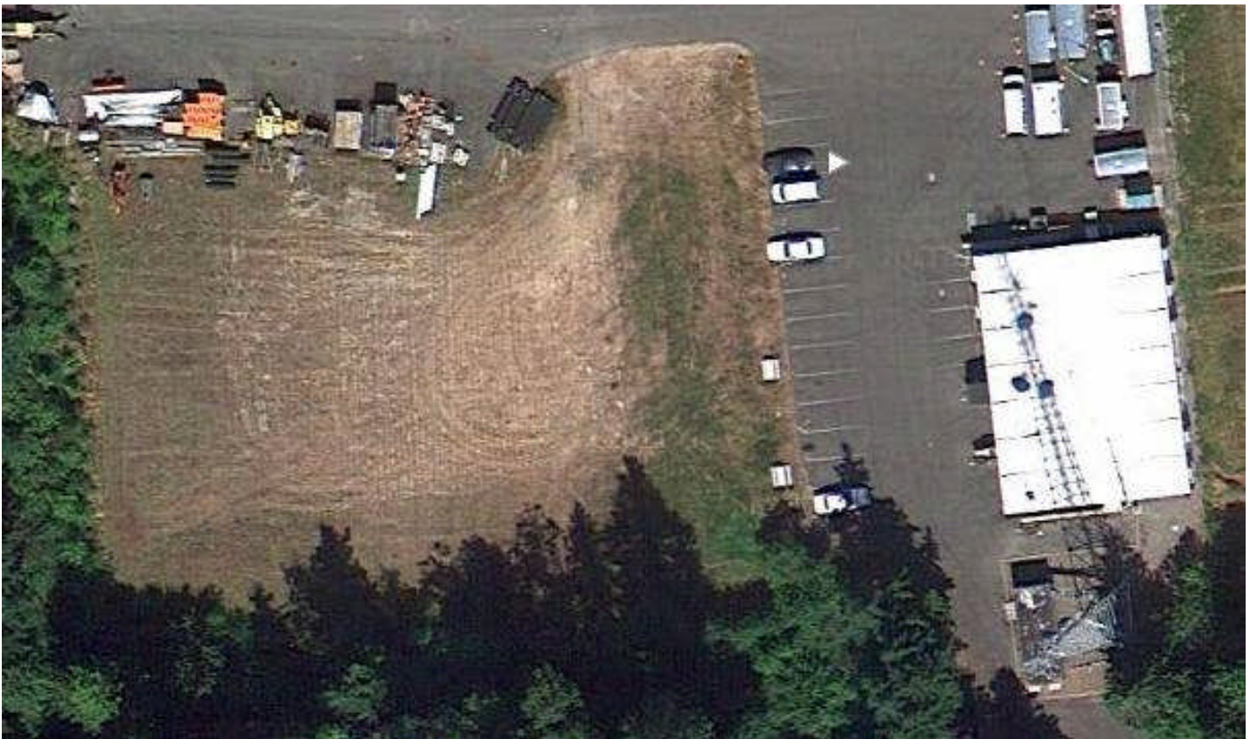
Figure 1. Aerial view of the Puyallup Emergency Operations Center (EOC) site at 1200 39 th Avenue SE. The open field at the left will be the set-up area for Field Day stations. The building and tower at the right are part of the EOC facility.