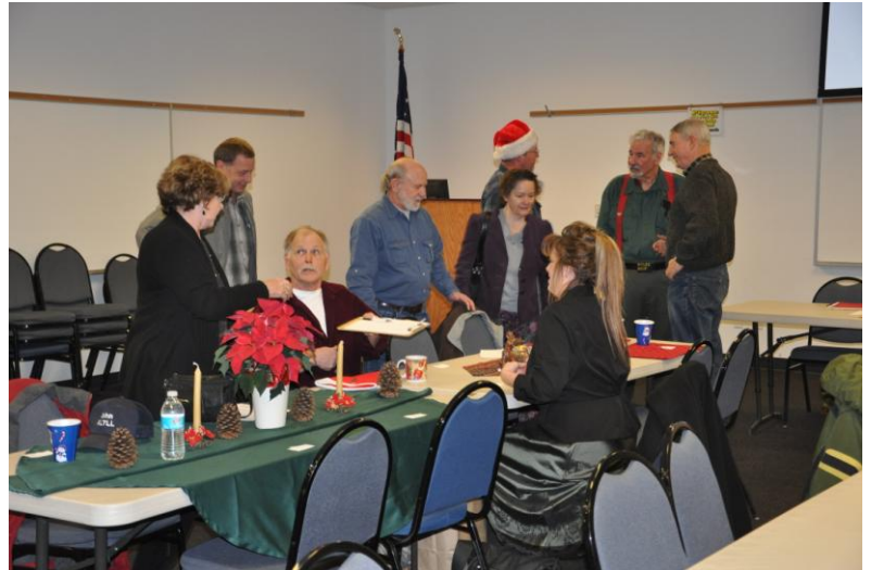
Bellies are full - time for good conversation!