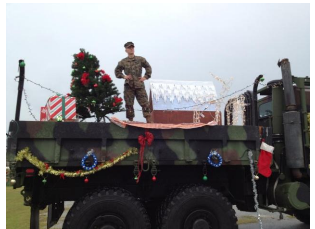
Christmas Parade at Kinser Base Okinawa Japan

If you have a loved one you would like featured here, just send me the info!