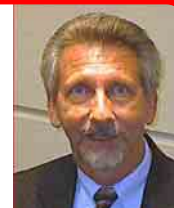
KR4WD-Treasurer Founding Member