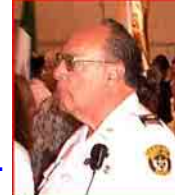
W2AGX - Member