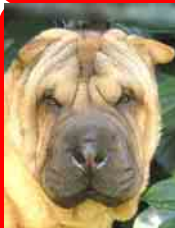
Calloosa Kid Ham want to be

Office Hours by Appointment: 790 - KIDS 790 - 5437